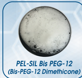
PEL-SIL Bis PEG-12 (Bis-PEG-12 Dimethicone)